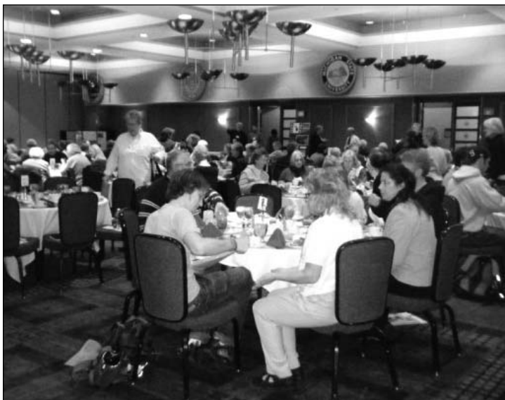
WAM Conference Luncheon